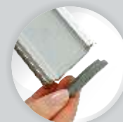
Nylon Moulded End Caps